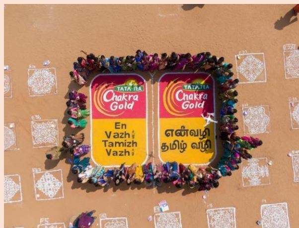
Students gathering at the mega event