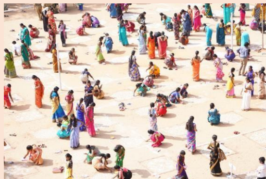
The students drawing dotted kolams

By wearing traditional costumes, the entire participants started drawing their kolam enthusiastically and finished it after an hour.