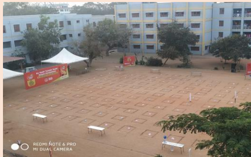
The ground arranged for the event

The participants assembled in their allotted place in the blocks of 4*4 feet and were divided and they were provided with kolam flour.