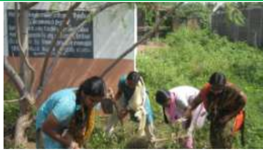
Clean India Programme