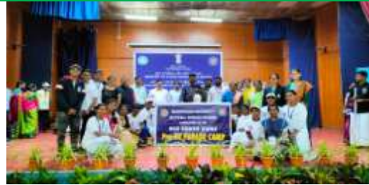
NSS Pre Republic Day Parade Camp