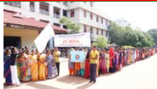
Fit India Freedom Run