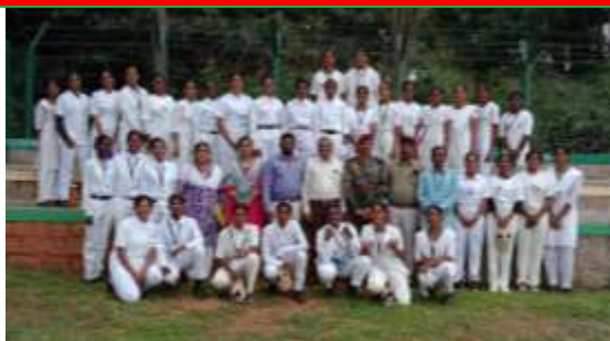
South Zone RD Parade Camp