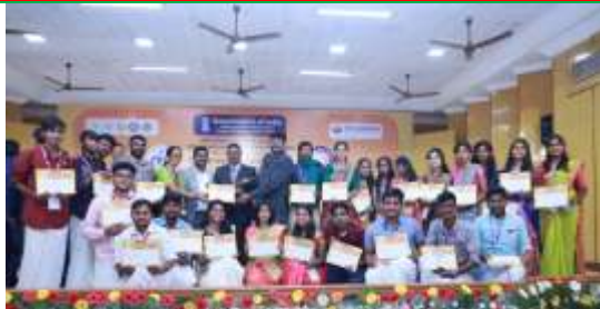
National Integration Day