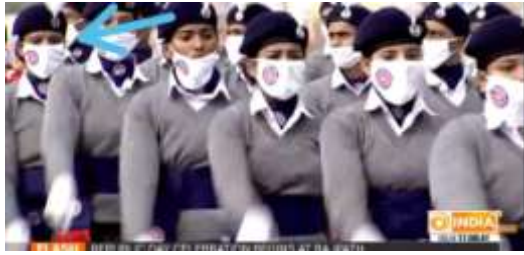
NSS Republic Day Parade Camp