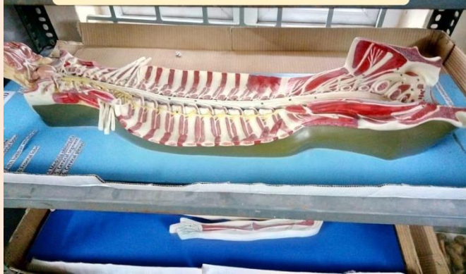
Peripheral nervous system