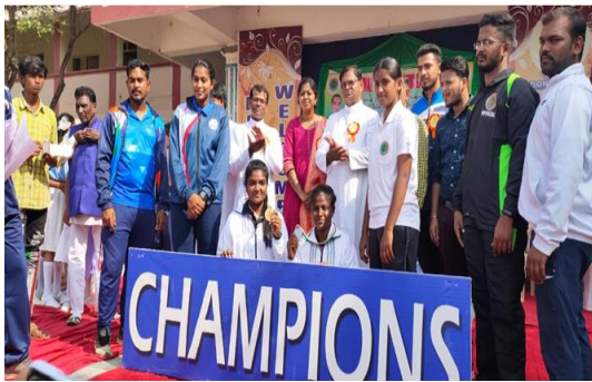
Table Tennis- Winners