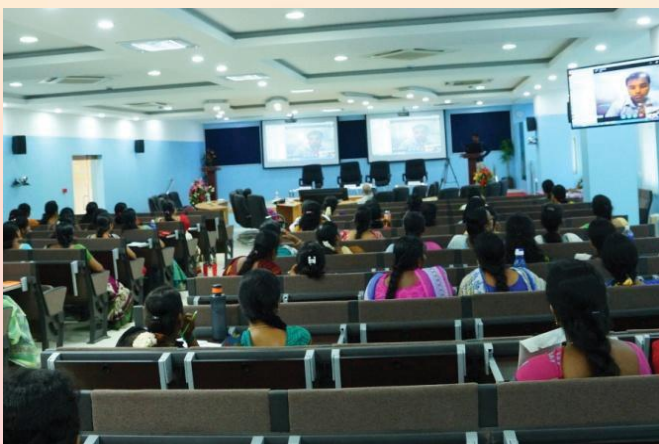
Session III –Videoconferencing by Dr.G.P.Jeyanthi