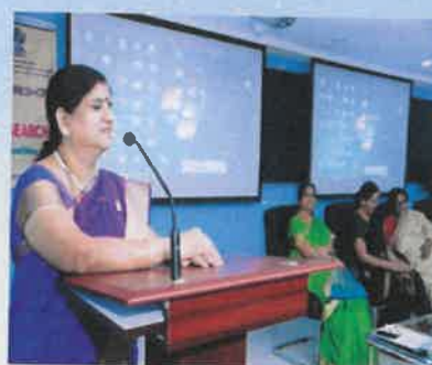
Greeting the guest