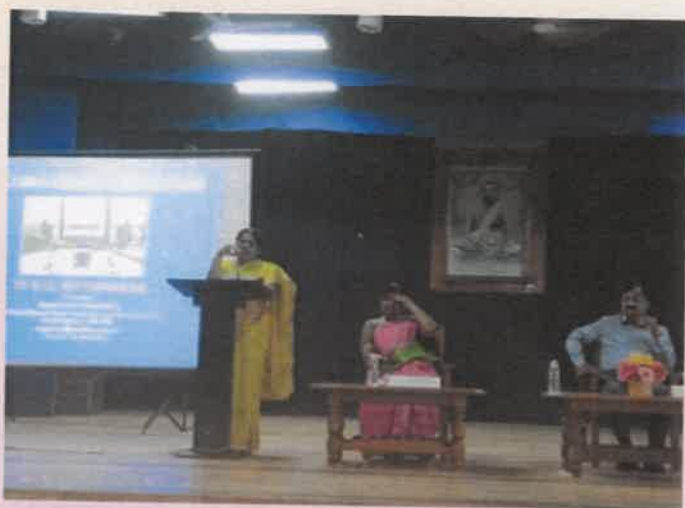
Welcome Address by IQAC Coordinator