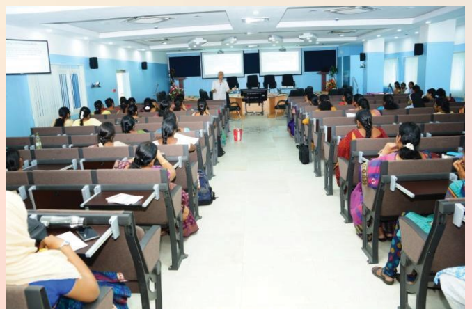
Session IV by Dr.Murari Tapaswi