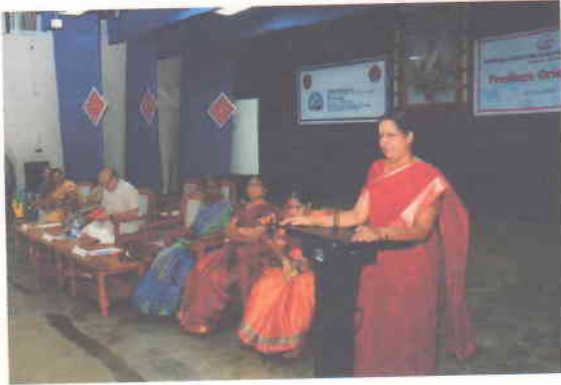
Vice Chancellor addressing the Gathering