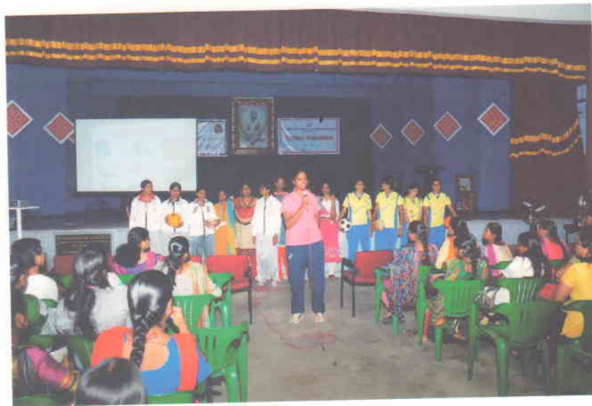
Sports Director orienting the students