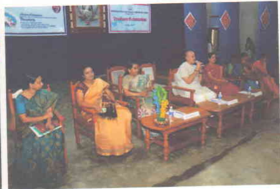
Chancellor Addressing the Gathering