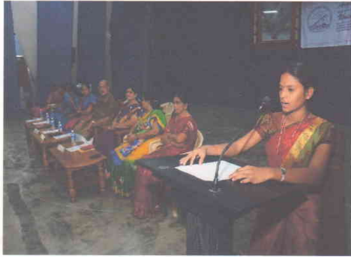
Welcome Address - Student Chair person