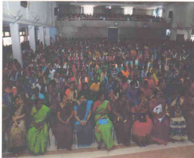
Participants of the programme