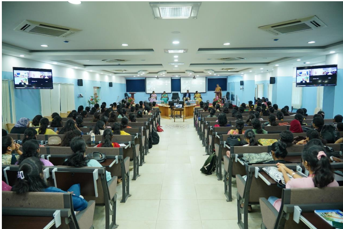
Audience at the seminar