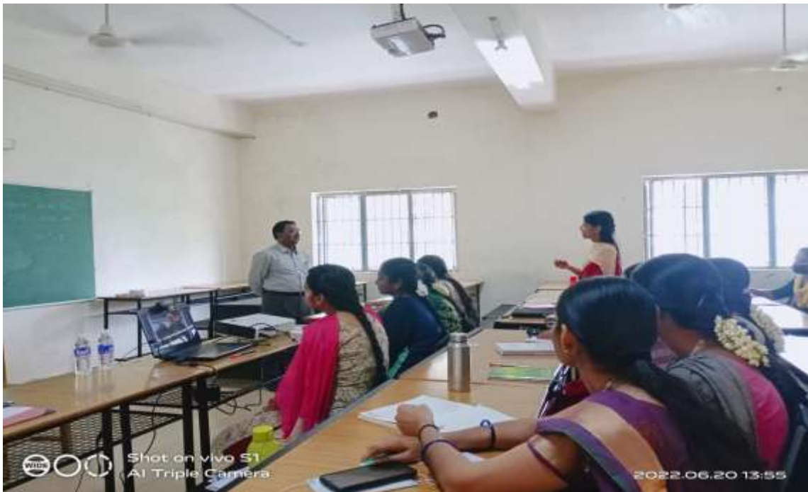
Feedback Session - 2