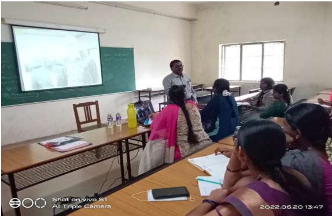
Feedback Session - 1