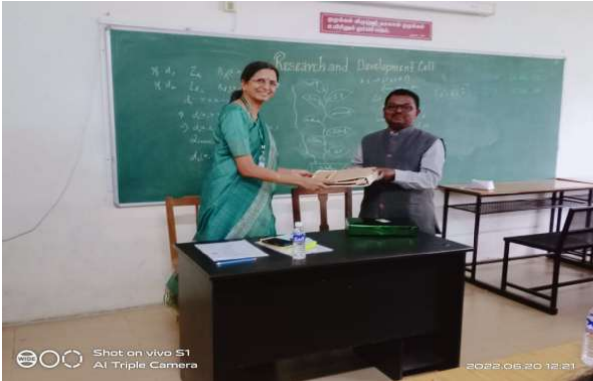
Honoring the Chief Guest with Memento