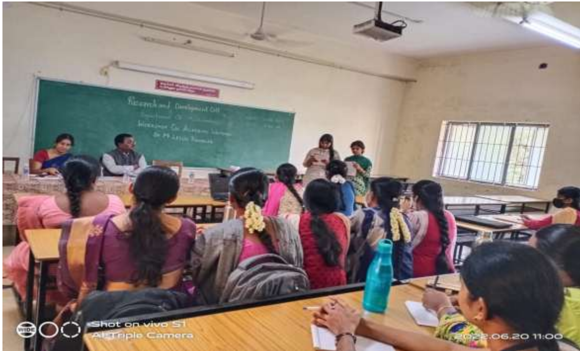
Introduction to Chief Guest by Research Scholar