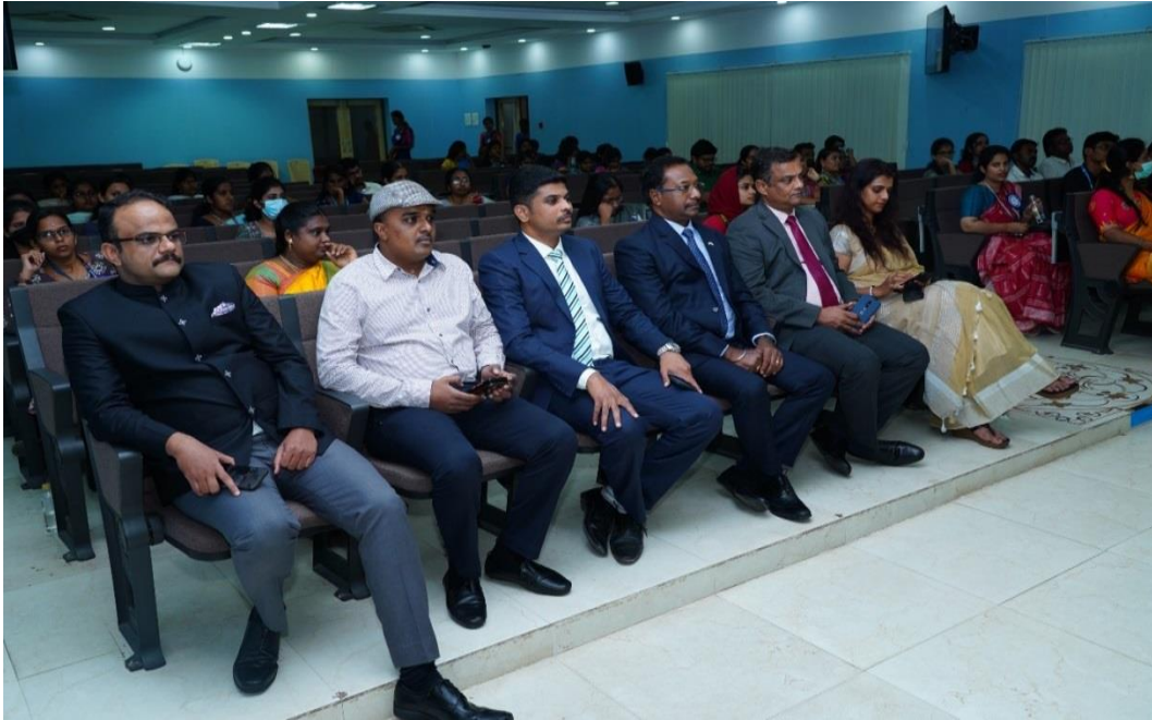
Audience of Conference ASTH 2022