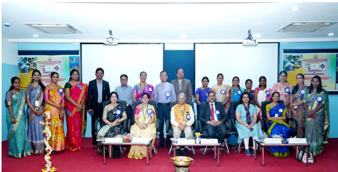
Group photo with delegate: First day of conference