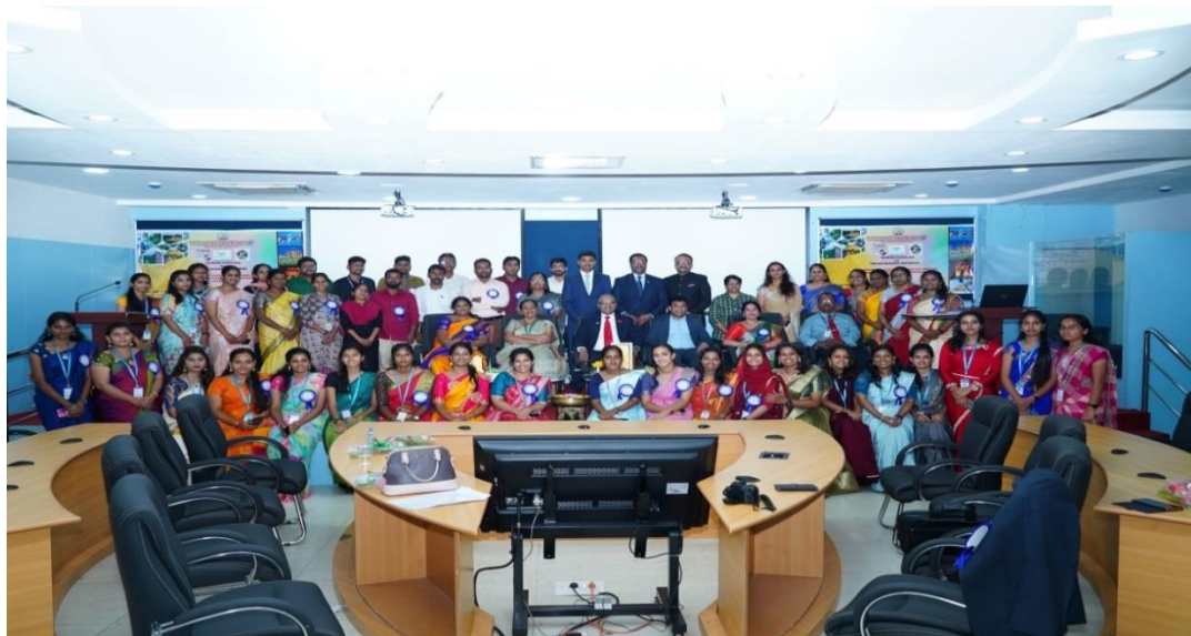
Group Photo with delegate 2 nd day of conference