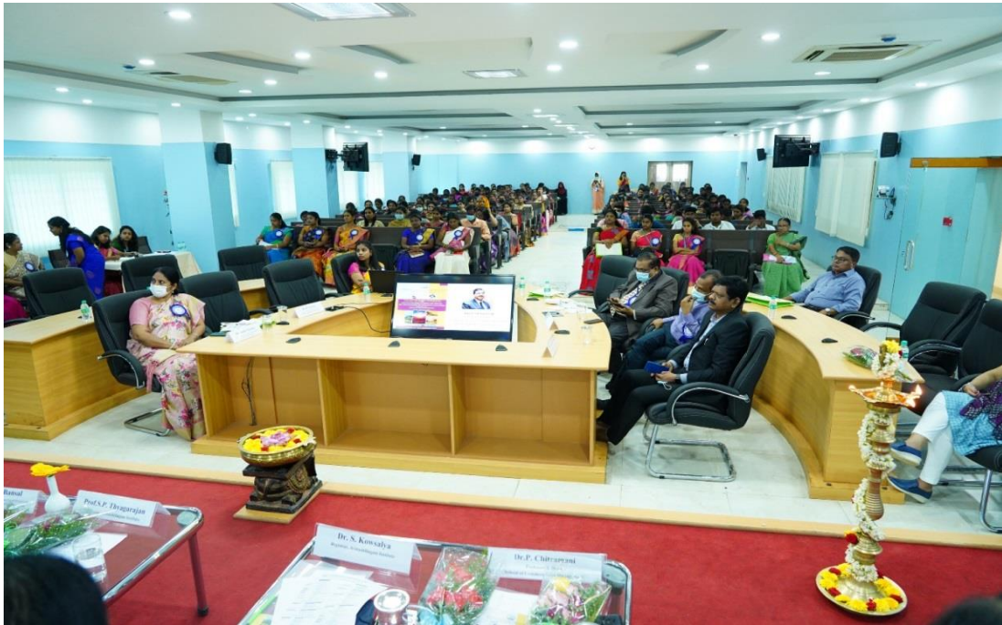
Audience of Conference ASTH 2022