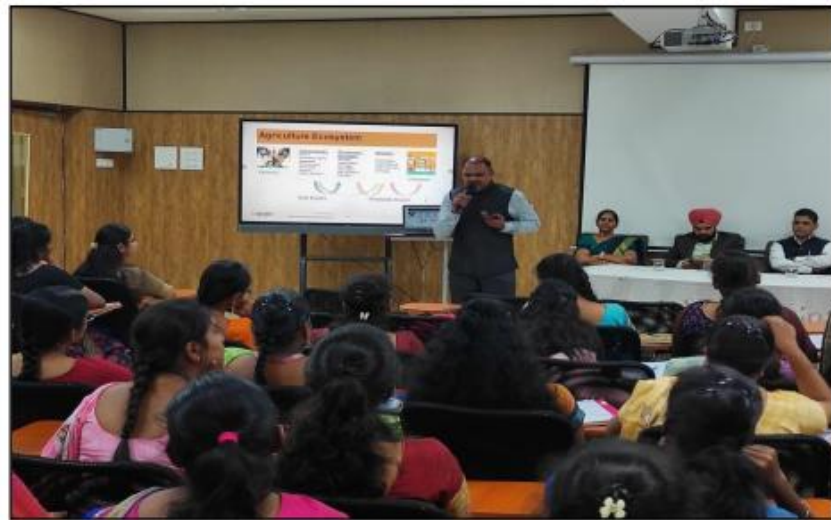
Commodity Derivative Markets