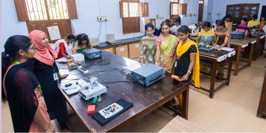
Data Analytical Methods for Dietetics Research