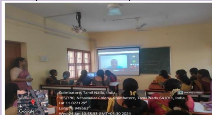
Student seminar Psycho-education for autism spectrum disorders