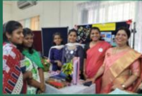
Tamil Literary Club