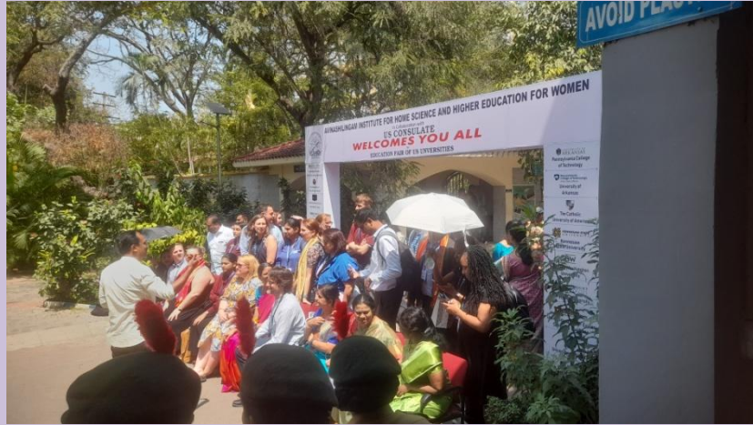
US Consulate Education Fair