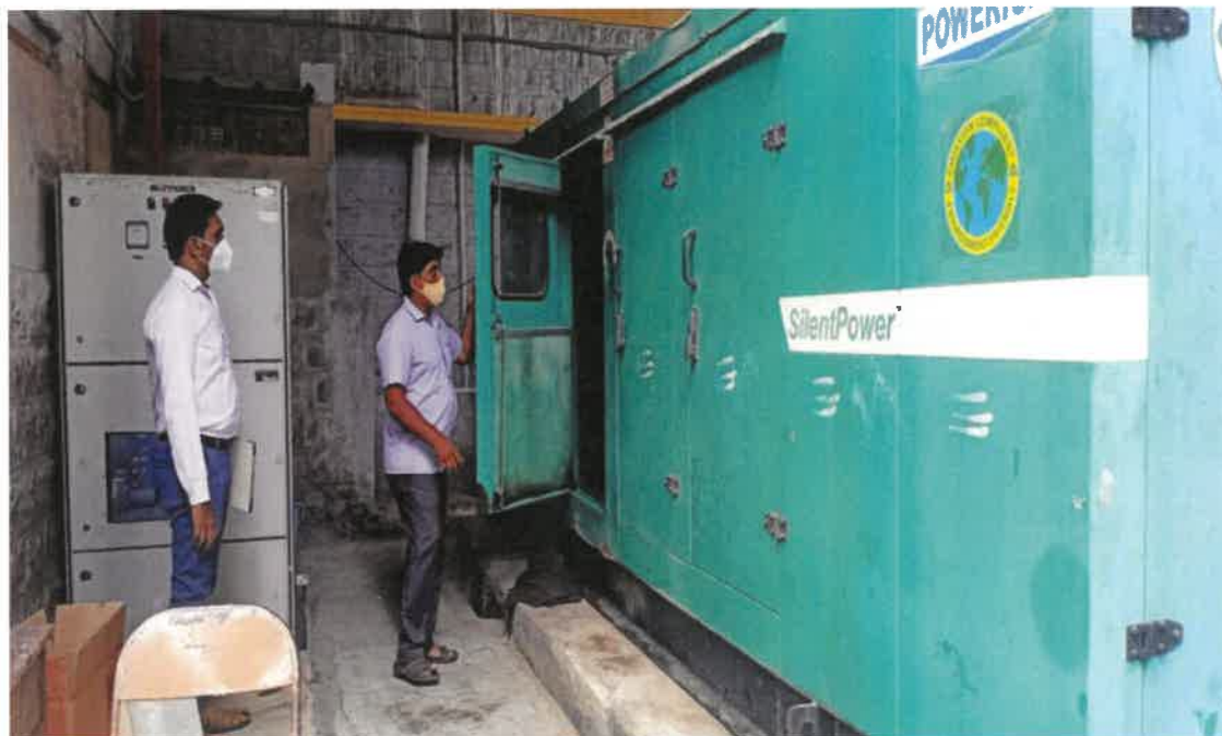
Generator Installed at Campus -I