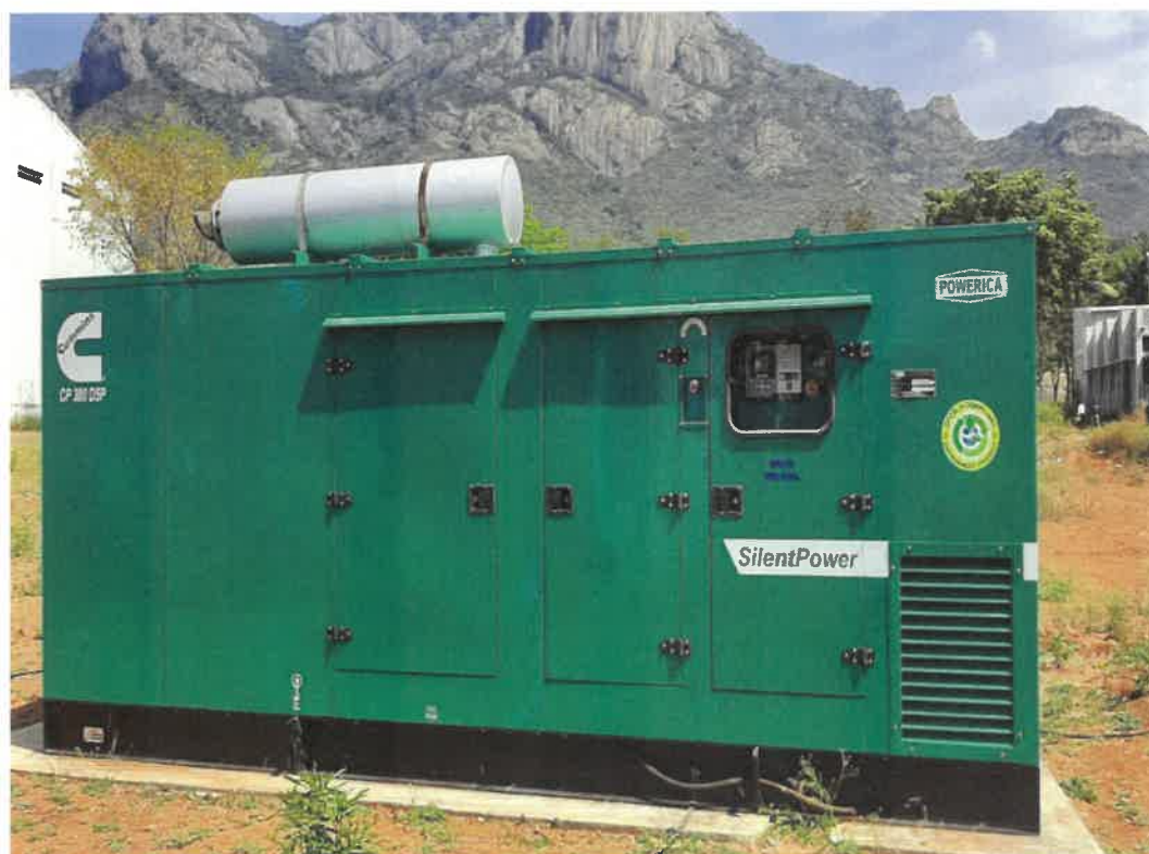
Generator Back up at Campus II