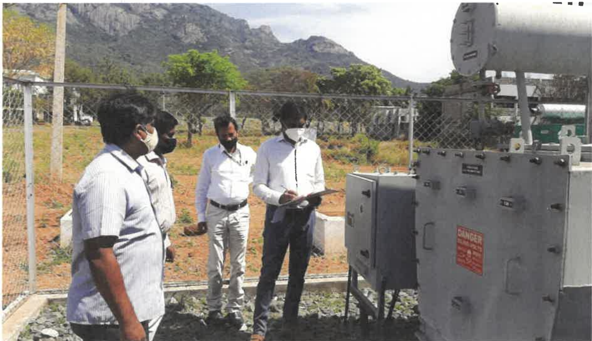
Figure 1. Gathering information about the utilization of electricity during Audit in Campus -II

It is also called a simple audit, screening audit or walk-through audit. The main purpose of walk-through audit is to obtain general information. More specific information can be obtained from the maintenance and operational people during the time walk through audit. It also involves a brief review of facility utility bills and other operating data and a walk-through of the facility to become familiar with the building operation. The major problem areas are identified during this audit.